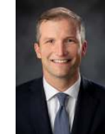
Chairman Moore Capito